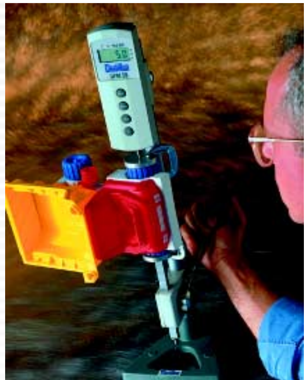
DFM with LTS Series Mechanical Stand

SPECIFICATION SS-FM-3110-1200 December 2000